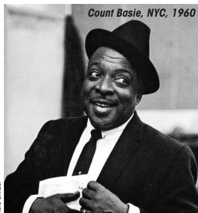
Count Basie, NYC, 1960