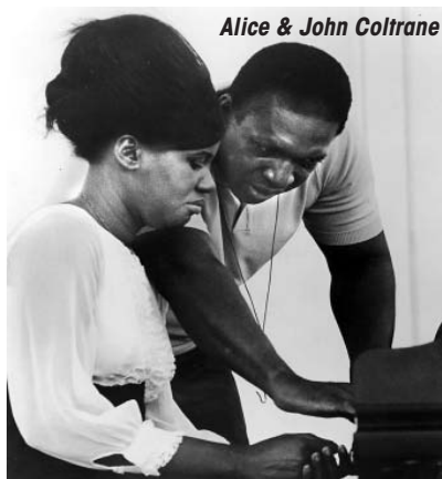
Alice & John Coltrane