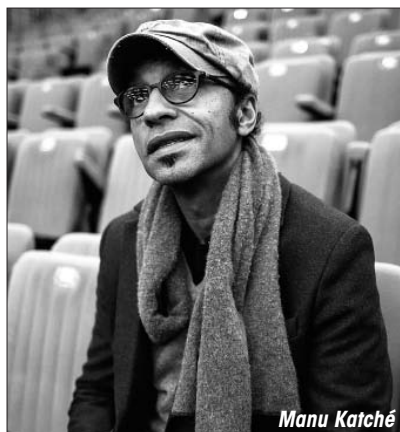
Etienne de Villars