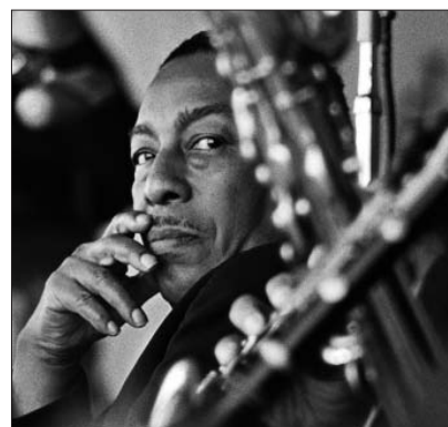
Johnny Hodges from Jim Marshall's book Jazz Festival