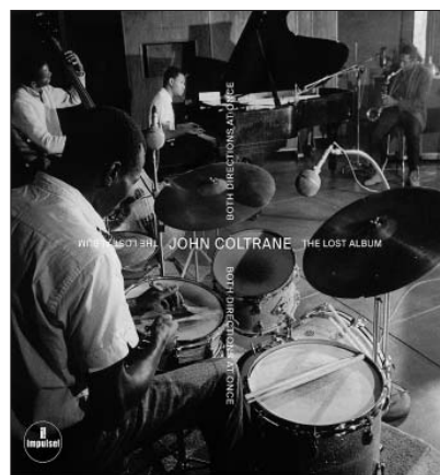
BOTH DIRECTIONS AT ONCE JOHN COLTRANE THE LOST ALBUM BONOLY PHOTOGRAPHY